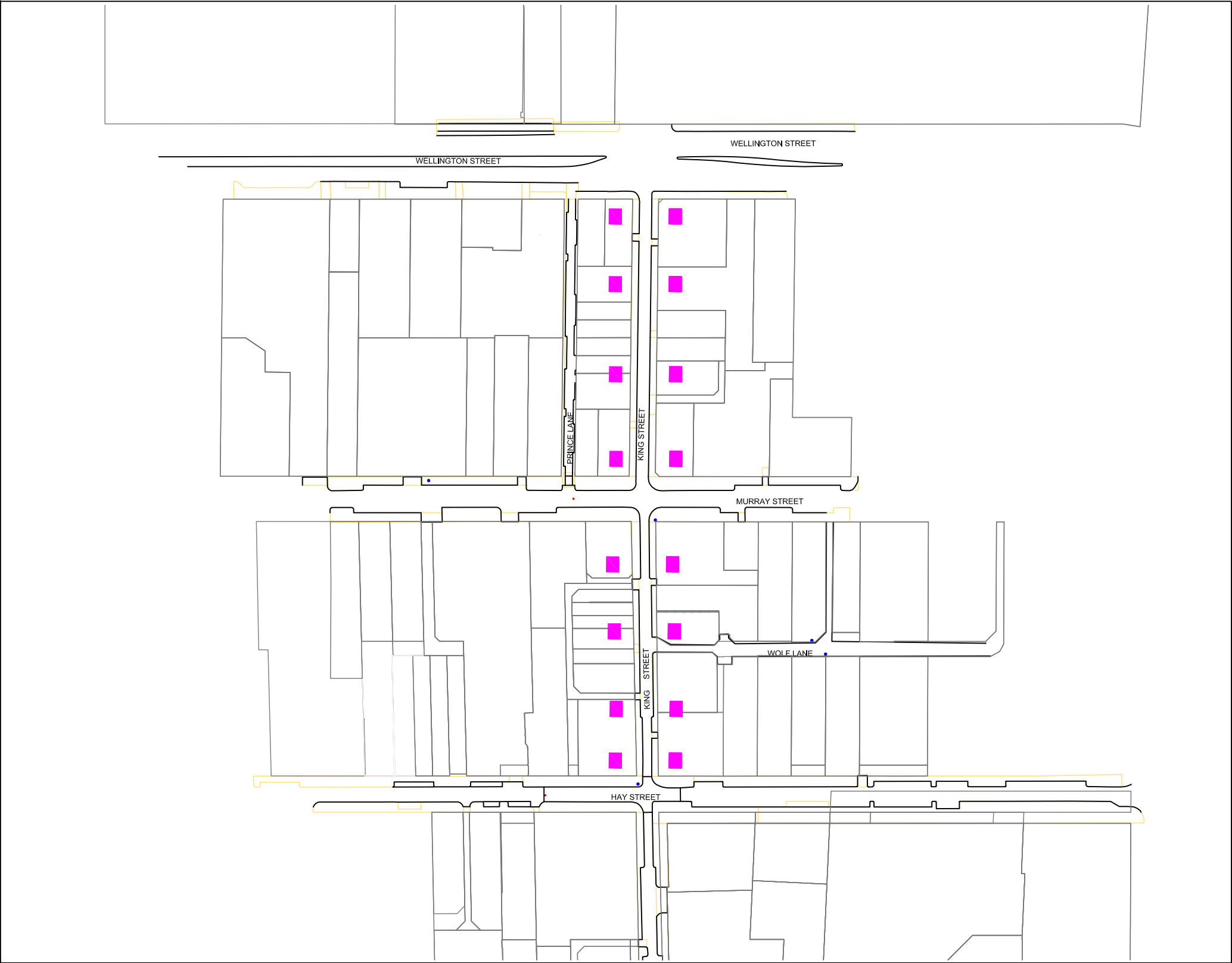
LOCATION PLAN Scale = 1:2000

THIS DWG & DESIGN IS SUBJECT TO COPYRIGHT AND MAY NOT BE REPRODUCED WITHOUT PRIOR WRITTEN CONSENT. CONTRACTORS TO VERIFY ALL DIMENSIONS ON SITE BEFORE COMMENCING WORK. REPORT ALL DISCREPANCIES TO PROJECT MANAGER PRIOR TO CONSTRUCTION. FIGURED DIMENSIONS TO BE TAKEN IN PREFERENCE TO SCALED DRAWINGS.